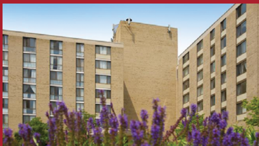
Lake Anne Fellowship House Reston, VA

We offer comfortable homes to 800+ older adults who occupy 670 units.