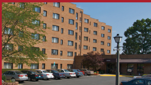
Lake Ridge Fellowship House Woodbridge, VA