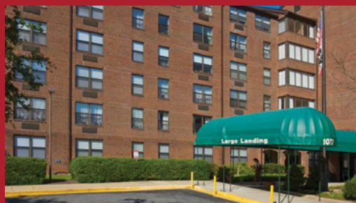
Largo Landing Fellowship House Upper Marlboro, MD