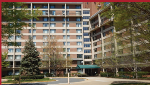
Hunters Woods Fellowship House Reston, VA