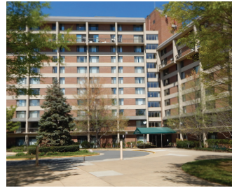
Hunters Woods Fellowship House (1979) is home to 222 residents.