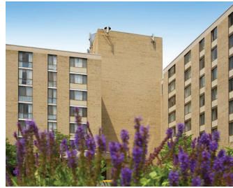
Lake Anne I (1971) Lake Anne II Fellowship House (1976) is home to approximately 214 residents.

Fellowship Square operates four apartment properties, providing housing for more than 635 seniors and individuals with disabilities who meet the federal income definitions to qualify for affordable housing.