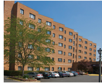
Lake Ridge Fellowship House (1983) is home to 99 residents.