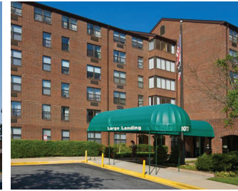
Largo Landing Fellowship House (1984) is home to 105 residents.