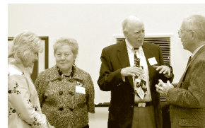
Listening to the speakers