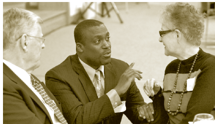
FSF staff thank volunteers.