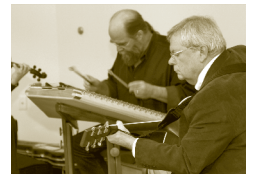
Members of Feel the Wag