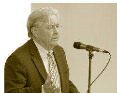
Radio personality Dan Scanlan