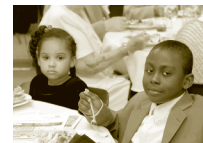
Guests include the young and old – celebrating our anniversary.